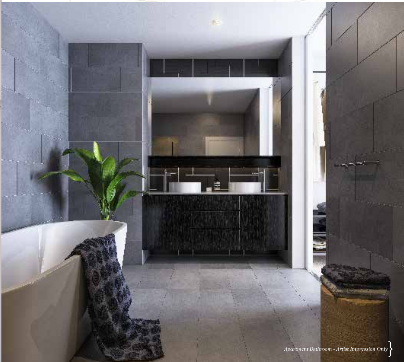
Apartment Bathroom - Artist Impression Only