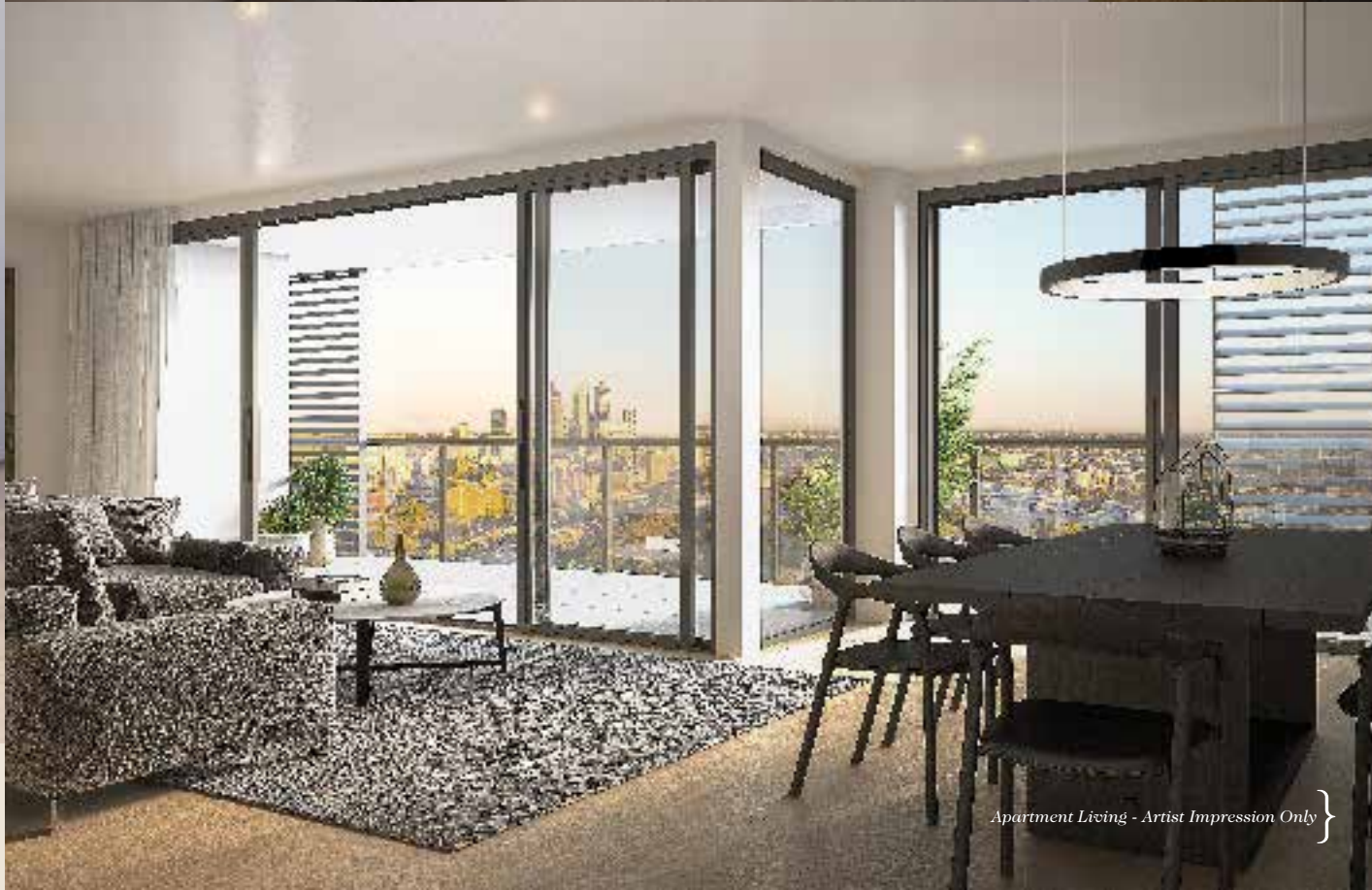
Apartment Living - Artist Impression Only