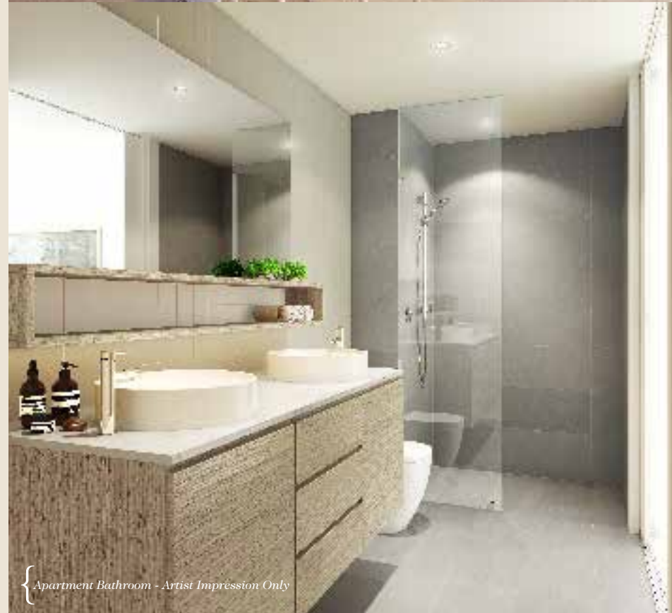
{ Apartment Bathroom - Artist Impression Only