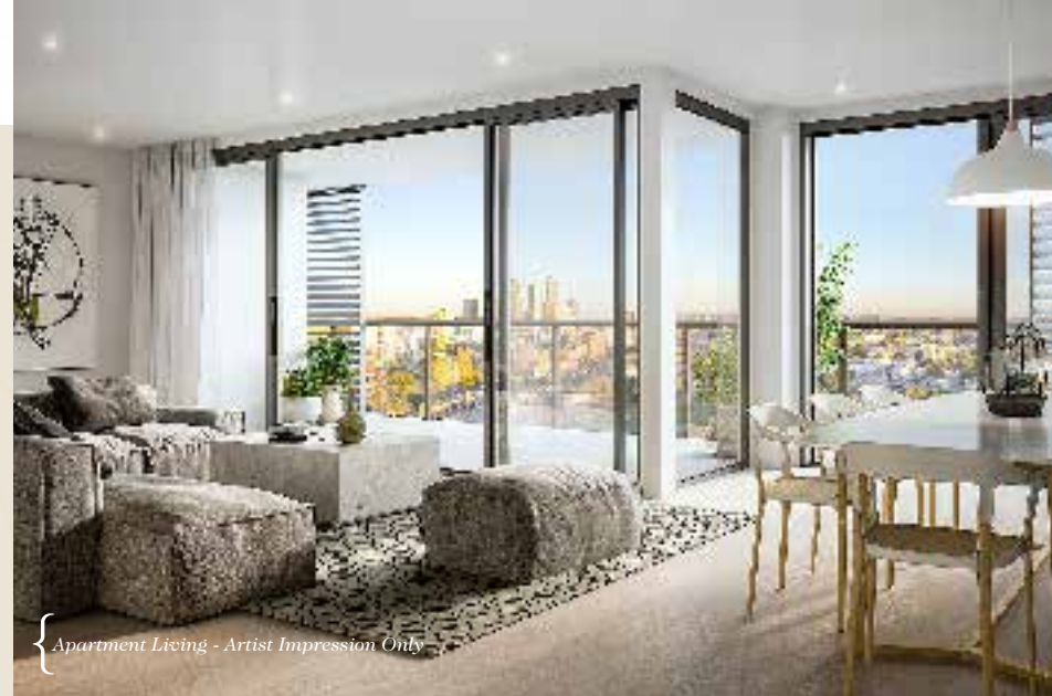
{ Apartment Living - Artist Impression Only

Plus, the meticulously streamlined bathroom offers yet another level of indulgence.