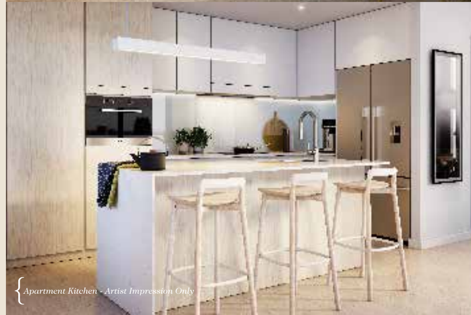
{ Apartment Kitchen - Artist Impression Only